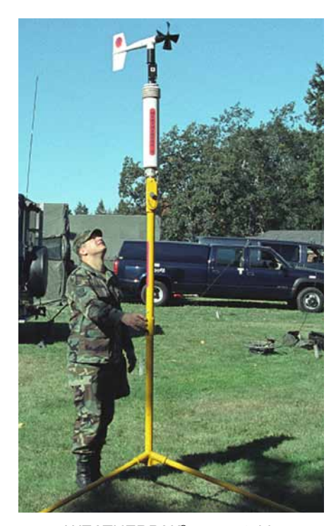
WEATHERPAK® on portable three meter tower

For more information, call: (800) 488-8291 or email: Marketing@CoastalEnvironmental.com