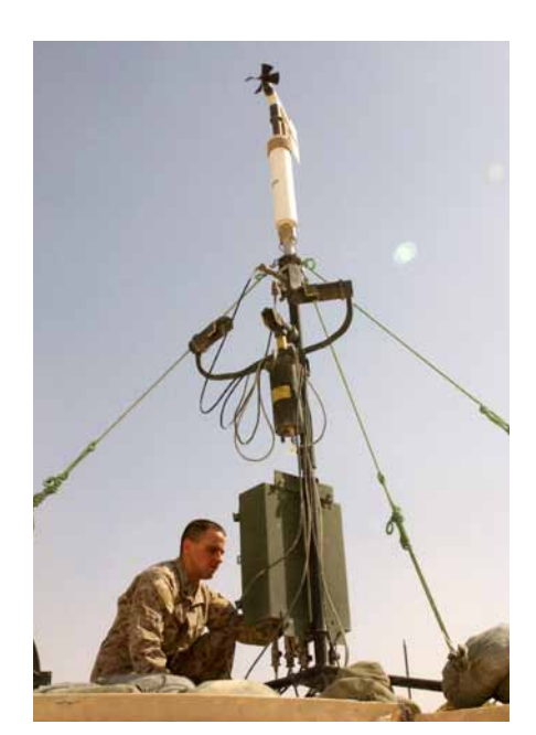
Military WEATHERPAK® with additional visibility sensor