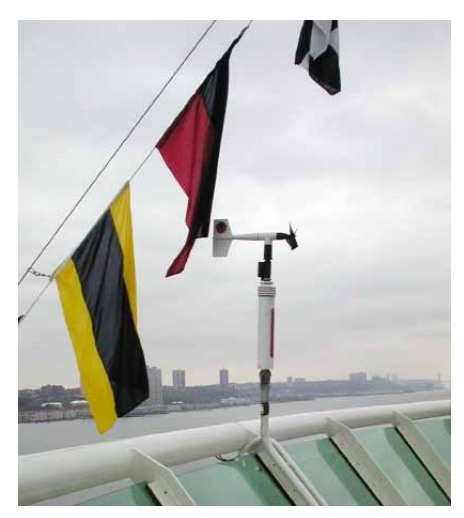
This cruise ship features WEATHERPAK®s port, starboard and aft